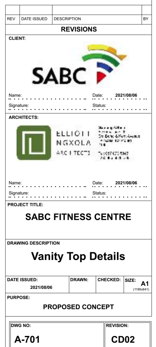
VTD Section B 1:10